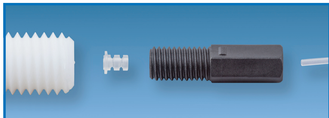
Piston Thread: 1/4"-28G Ferrule Nut Tubing 1/16" (0.8 x 1.6)